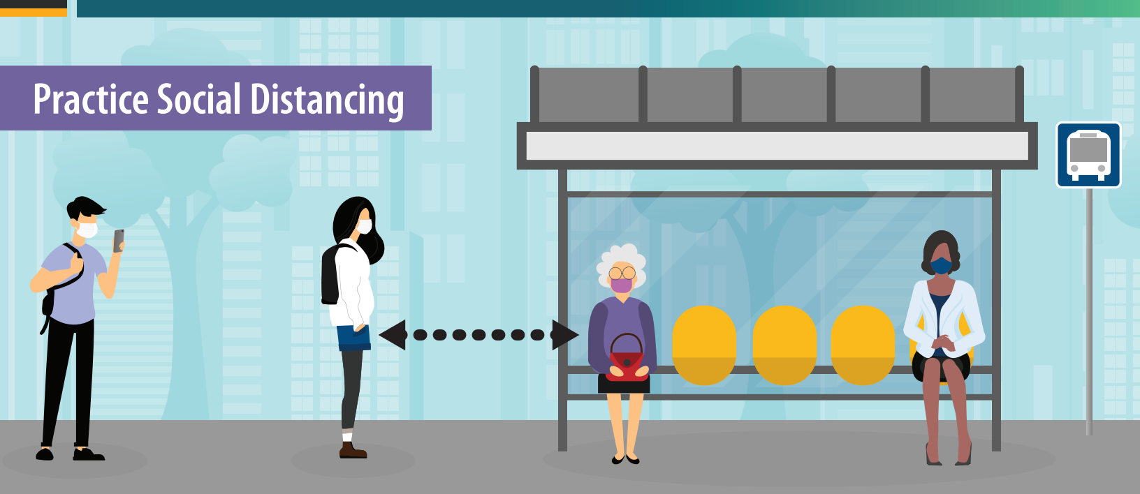
Stay 6 feet (2 arm's lengths) from other people.